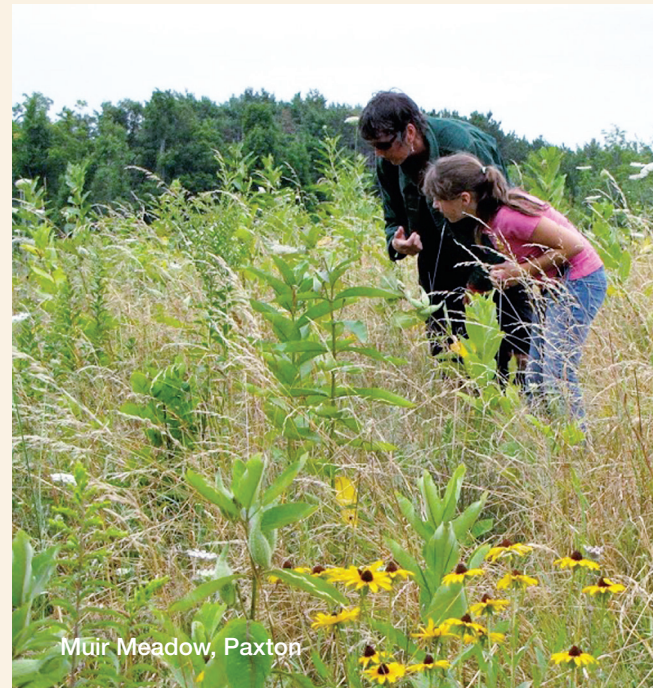
Muir Meadow, Paxton