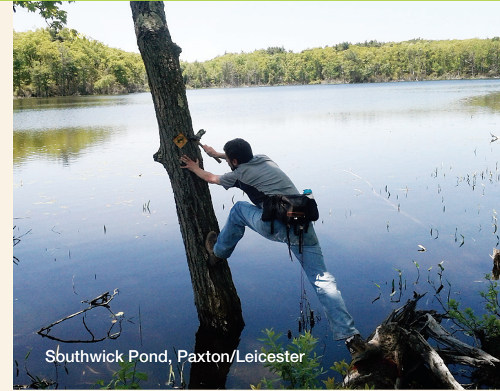
Southwick Pond, Paxton/Leicester

You can email us at mail@gwlt.org or call us at 508-795-3838 for more information on any of these opportunities.