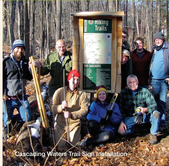
Cascading Waters Trail Sign Installation

Since its inception, GWLT has preserved more than 2,300 acres of land in the Greater Worcester area for the purposes of resource protection, scenic beauty, and passive recreation. All of these lands are accessible to the public. You can find locations and descriptions of our properties, along with hiking maps, on our website – gwlt.org .