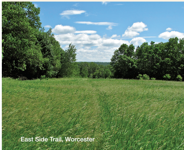
East Side Trail, Worcester