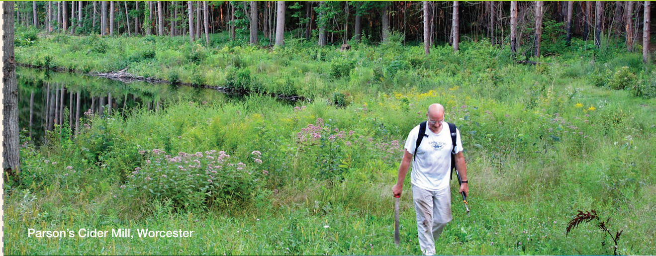
Parson's Cider Mill, Worcester